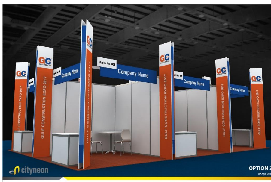
Proposed Enhanced Shell Scheme Design for GULF CONSTRUCTION EXPO 2017

This drawing is the property of Cityneon and we reserve the copyright to all our designs which cannot be reproduced (whether in part, whole, or modified) without first obtaining our written consent. Construction will be provided. This drawing is submitted for modification in terms of design & measurement from time to time to suit site construction purposes.